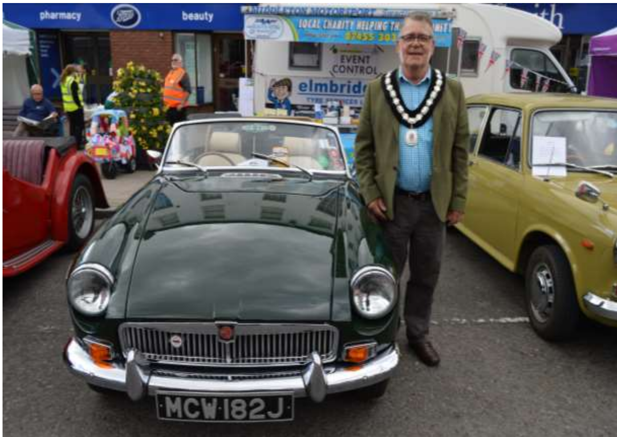
The Mayor at the Ashby Festival of Transport, Market Street July 2017.

Chairman of the Events & Entertainment Committee. March 2018.