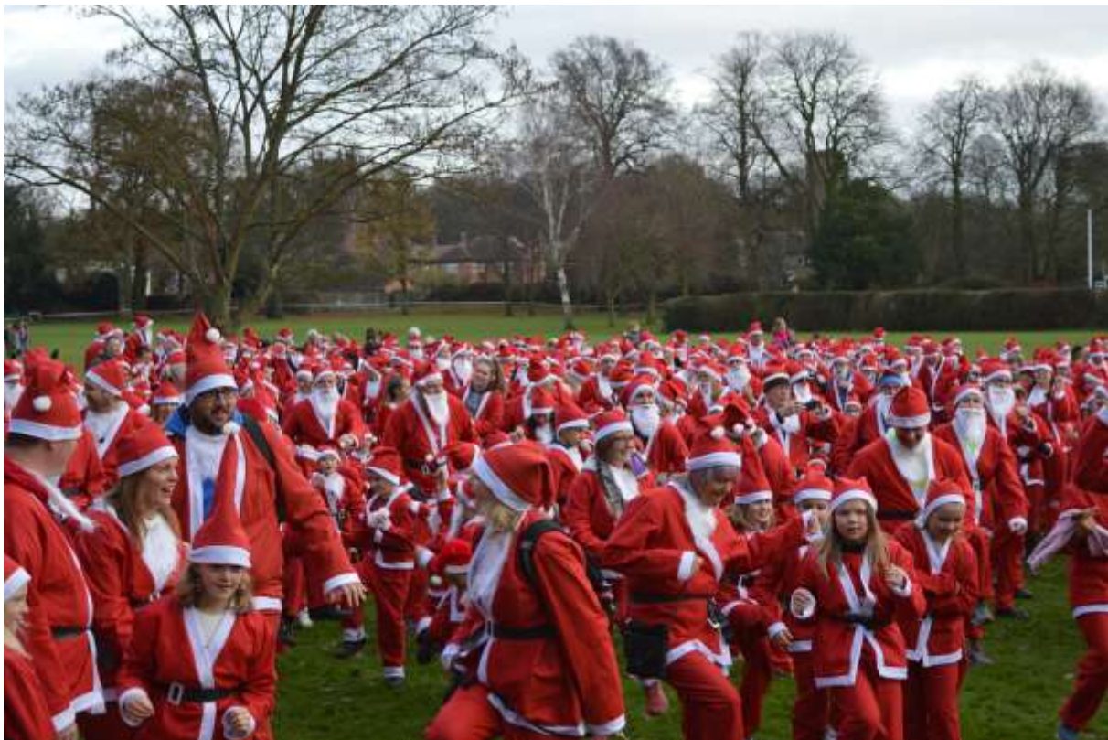
Santa Fun Run/Walk 2017.