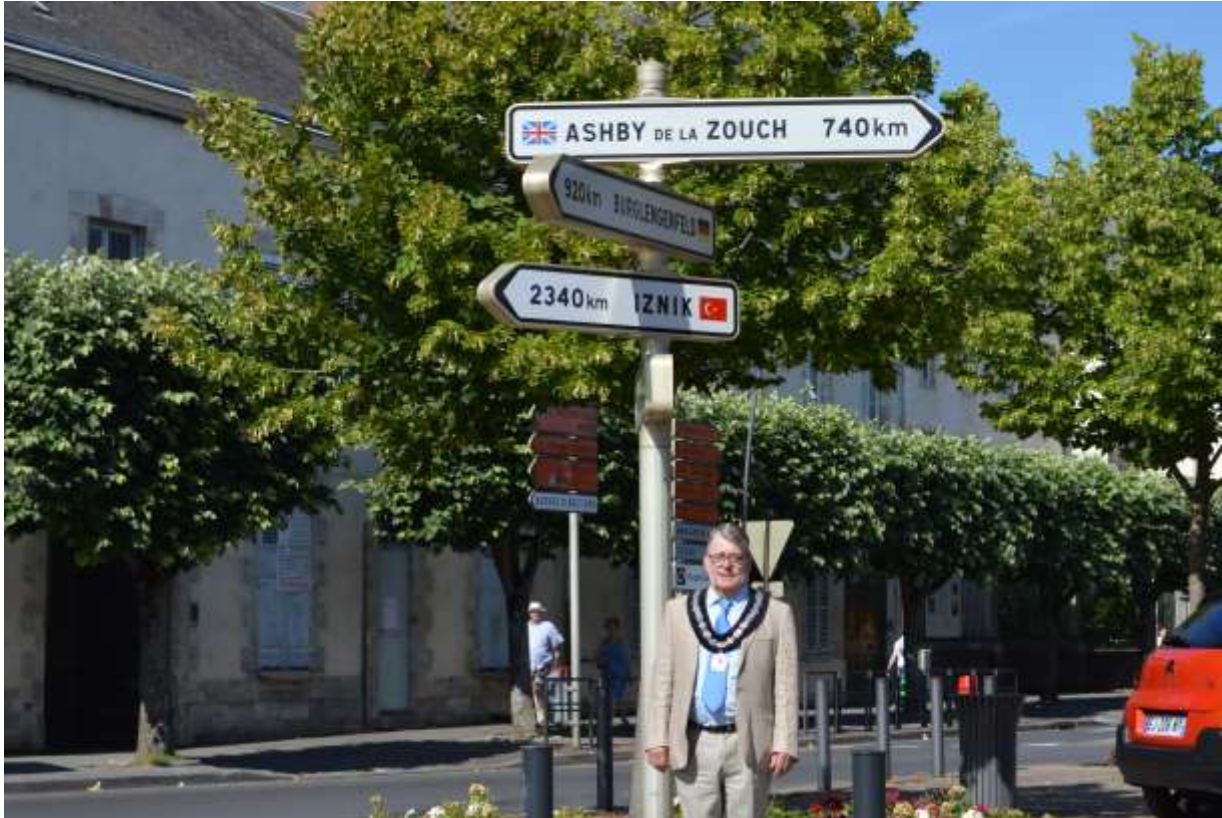
The Mayor on a twinning visit to Pithiviers June 2017.